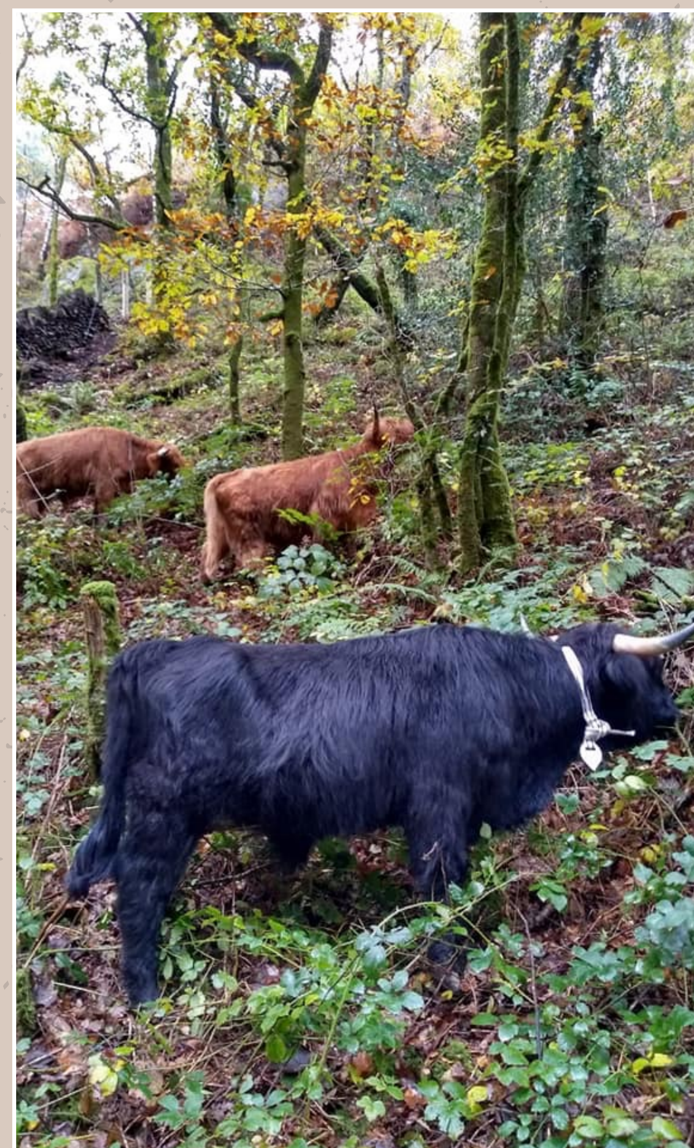
Cattle grazing compartment 1 on their first day on site