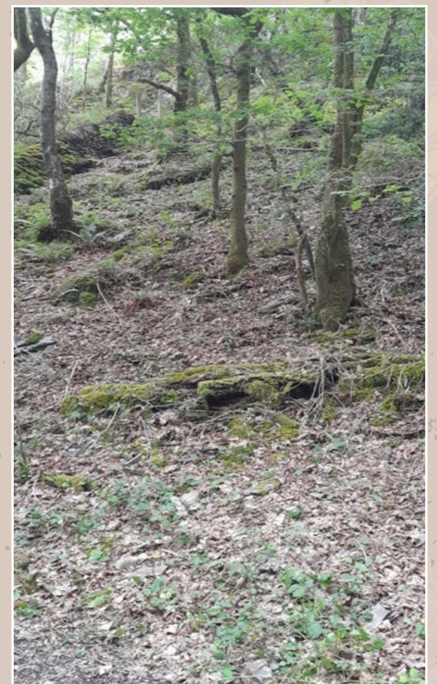
Same area June 2023. Bramble has not returned